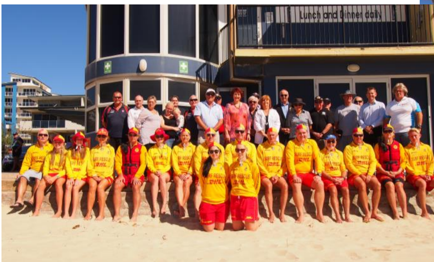
Memorial Day 2015