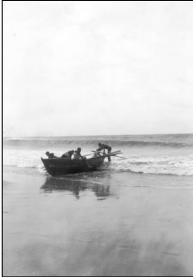
"SWAN" 1934 Maroochydoore Surf Lifesaving Club Boat Crew in the Club's first surf boat, Maroochydoore Beach, 1934

Our Centenary History can now tell a pretty comprehensive tale, and what a tale it is!