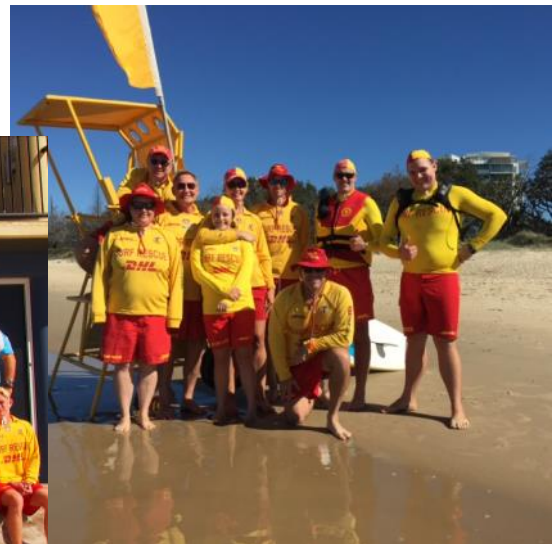
Last Patrol of the year