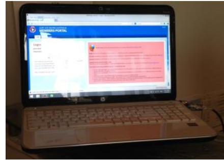
Self serves kiosk at reception

All members are required to create a Member Portal account to renew their membership. This is done at https://portal.sls.com.au . Once logged in click Lifesaving Online tab.