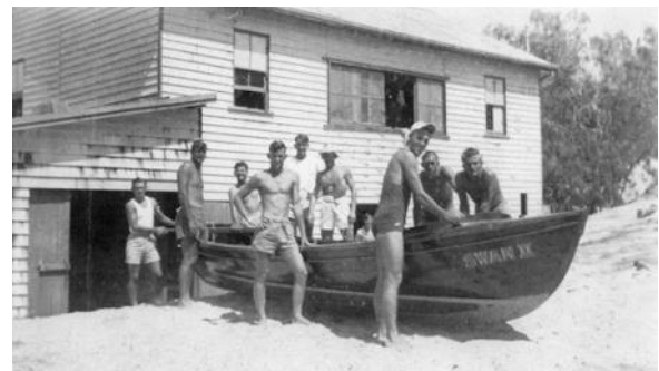
"Swan II" IN FRONT OF THE OLD CLUBHOUSE Members of the Maroochydoore Surf Lifesaving Club with the Club's surfboat 'Swan II', Maroochydoore Beach, December 1949 [picture]