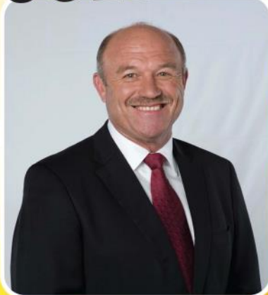
Wally Lewis Former Australian/ Qld/ Broncos Rugby League Legend