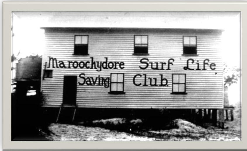
The original Club House, constructed TO BE CONFIRMED

Today the 'Black Swan' is renowned throughout the Lifesaving World.